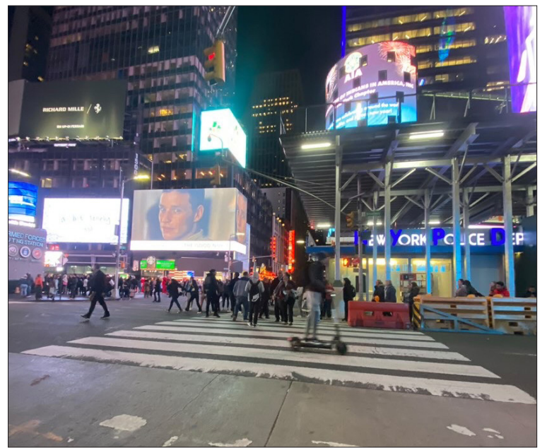
Outside of N.Y.P.D. in NYC