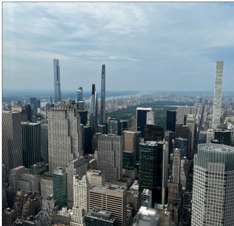
Skyline view of skyscrapers in NYC