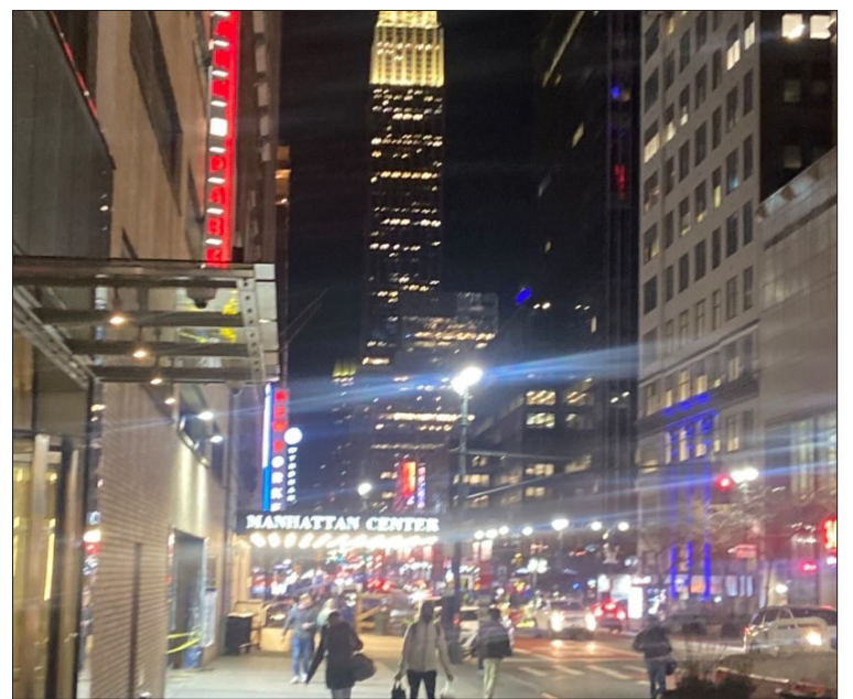
The Manhattan Center in NYC