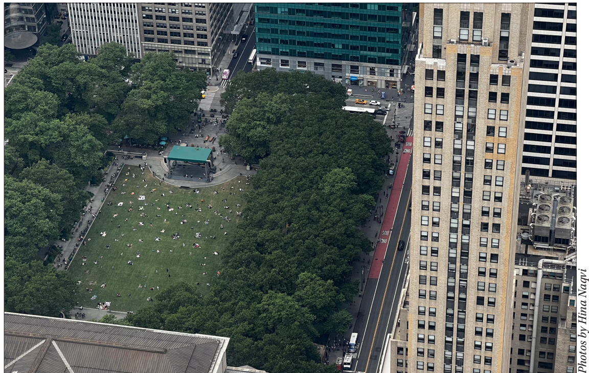
Skyline view of public speaking area