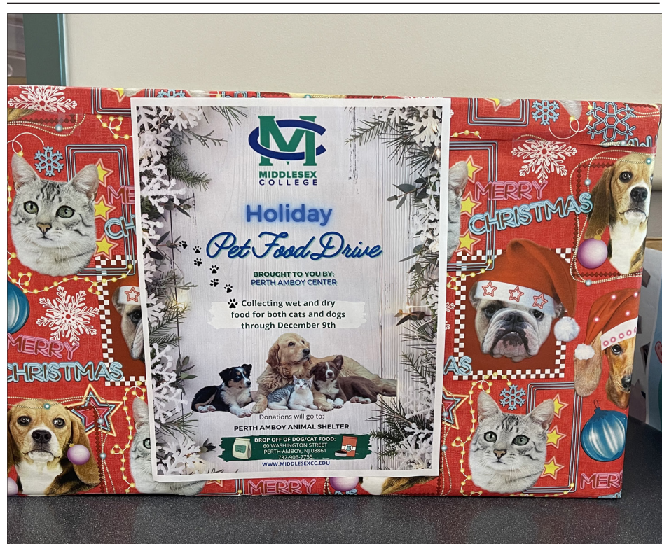
Nicely decorated donation box for the Holiday Pet Drive