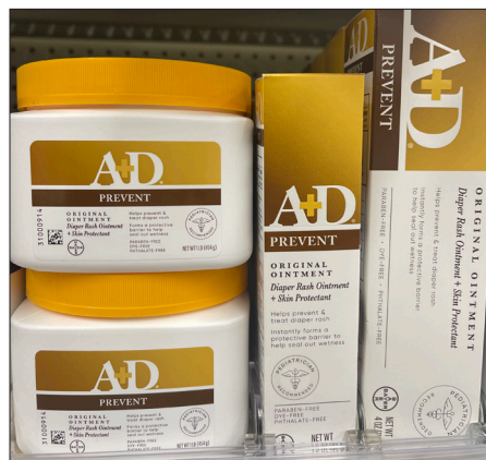
Diaper rash ointment