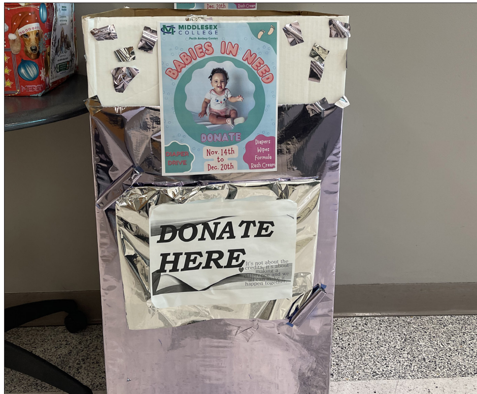
The donation box for the Babies In Need