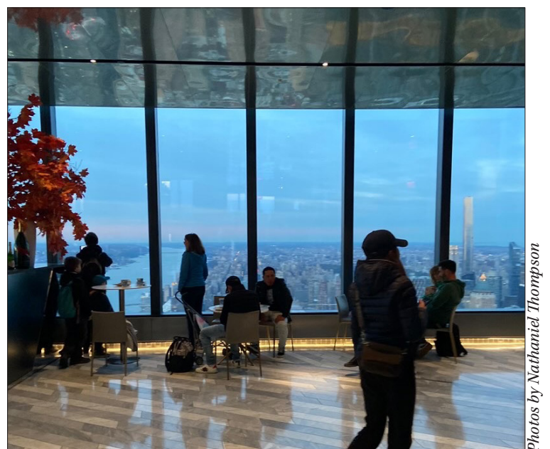
Interior of The Edge