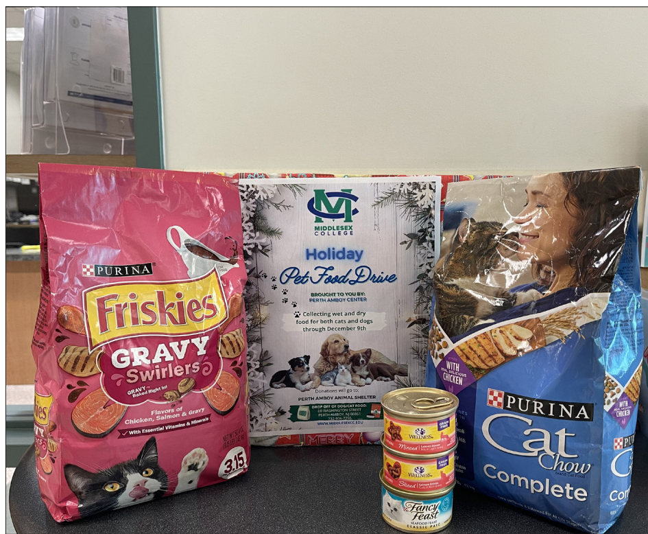
Some of the wet and dry foods that have already been donated for the Perth Amboy Pet