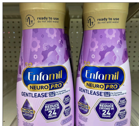
Enfamil formula bottles

The donation drive was initially planned to run from Nov. 14 until Dec. 20, but now it is running until Dec. 15. This is to match the end of the semester and be able to catch responses from students. So they (the people at the center) can drop off all of the items on the last day of the semester, Dec 16, said Abreu.