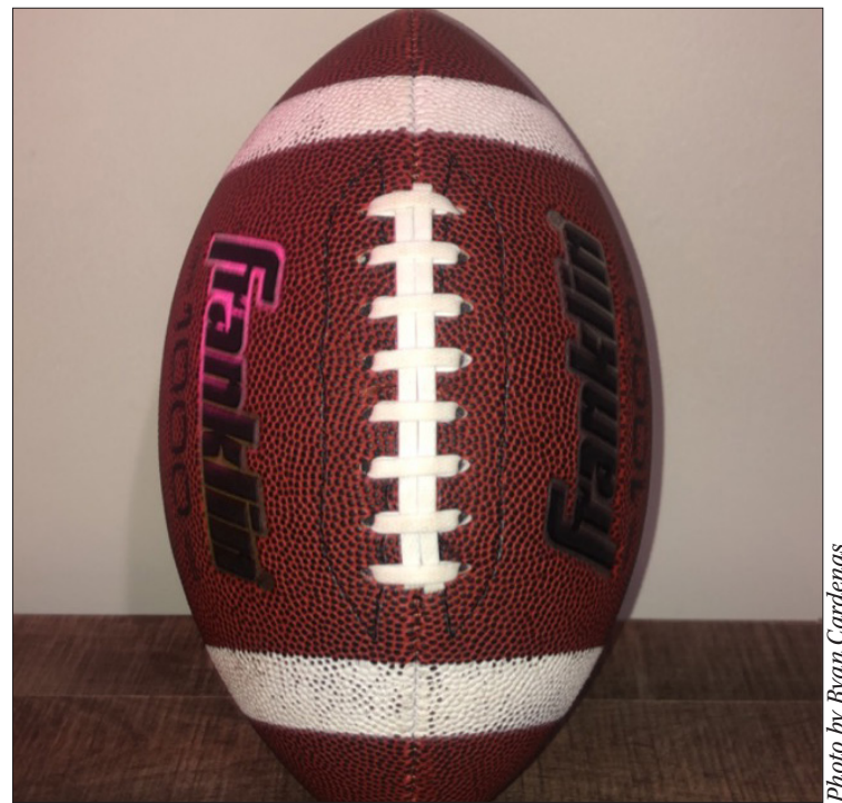
Junior Size Football

After looking at these two athletes, I see why they are able to dominate at the top with their age too. It's their diet plan and the new age of technology. Athletes are getting the best of the best treatment. So, is father time really undefeated? I say no, Tom Brady and LeBron James are still playing at high levels. When they end up retiring, they'll still be at the top, and I count that as a loss for father time.