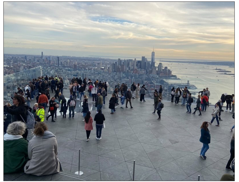
the top of The Edge

I was so locked in and excited, it looked like my smile was stitched together. With the Boston Celtics being one our top rivals, I knew we needed to have this game. I knew we needed to win this game. The ball flew in the air for the opening tip off, and we were on the way. First shot by Kyrie was up, and it was water. All net, all splash, and the Brooklyn Nets were also ready for the game. My back hit the seat, and I was finally in my comfort zone.